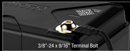
3/8"-24 x 9/16" Terminal Bolt

NLX Terminals offer versatile customization options to fit your dual purpose needs across various applications.