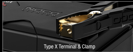
Type X Terminal & Clamp