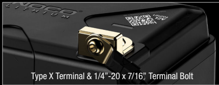
Type X Terminal & 1/4"-20 x 7/16" Terminal Bolt