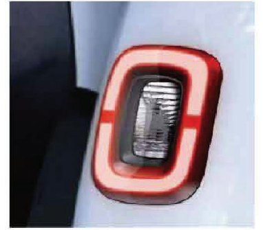
Combination Lamp (R)