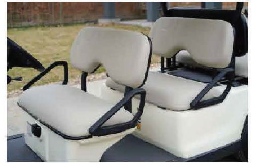
Artificial Seat Cushion