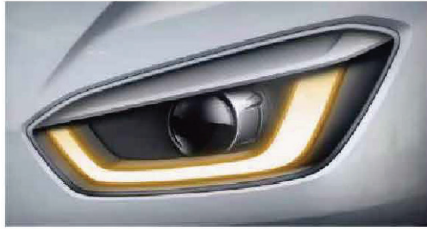
Combination Lamp (F)